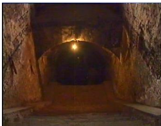
The Communist Jilava Prison. Entrance to the underground cells.

God needs dedicated ministers. You here, are free to minister. You are called to worship by unmasking the evils of communism and winning communists for Christ. Do you wish to be one? God needs you. He calls you to worship by action. A man plucked weed together with his wife in their garden. He saw an angel who told him "It is time to come to your eternal abode." The man answered "It would leave so much more work for my wife to do. Allow me to finish.' The angel nodded his assent. In the evening, the man helped his wife to wash the dishes. The angel came again calling him to the eternal abode. But they had had guests and the dishes were many. The man said "Let me not leave the whole burden of bringing the house in order to my wife. Let me tarry a little bit more." The angel acquiesced again. Late, when the man had gone to bed, he called the angel "Now you can come and take me to the eternal abode. The angel appeared and answered "That is where you have been this whole day." To work for the Kingdom of heaven is heaven. To work for the glory of God is to worship. God calls Christians to become workers in His harvest.