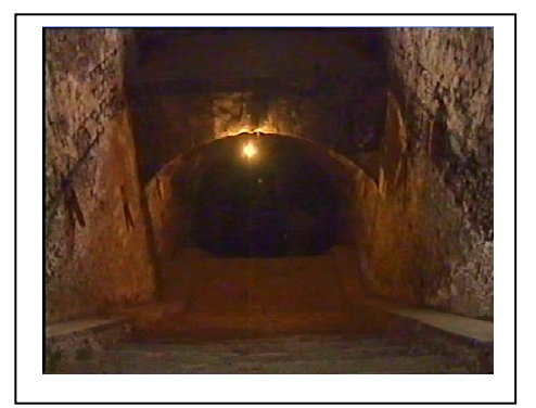
The Communist Jilava Prison. Entrance to the underground cells.