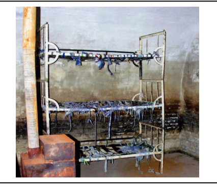
Prison cell with bunk-beds with no mattress, prisoners were obliged to sleep on. Stove for show only, never heated in cold winters.